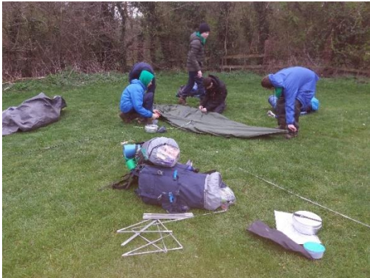
Silver participants continuing on Sunday after the bronze left and into Monday where they completed day 2 night training expedition, a step up from bronze: